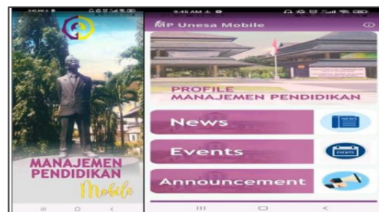
Figure 2. Home and menu display of MP Mobile Apps

In optimizing the management information system of the Education Management Department, namely the planning and problem-solving process in the form of solutions in the form of software (Ayan & Subekti, 2021). It has implications for software developers and designers to define plans for solutions that include algorithm design, software architecture design, database conceptual schematics and logical diagram designs, concept design, graphical user interface design, and data structure definition. In this study, we will use the Android Studio developer application IDE (Integrated Development Environment) created by Google in 2013. Here's an overview of the "MP Mobile Apps" application: