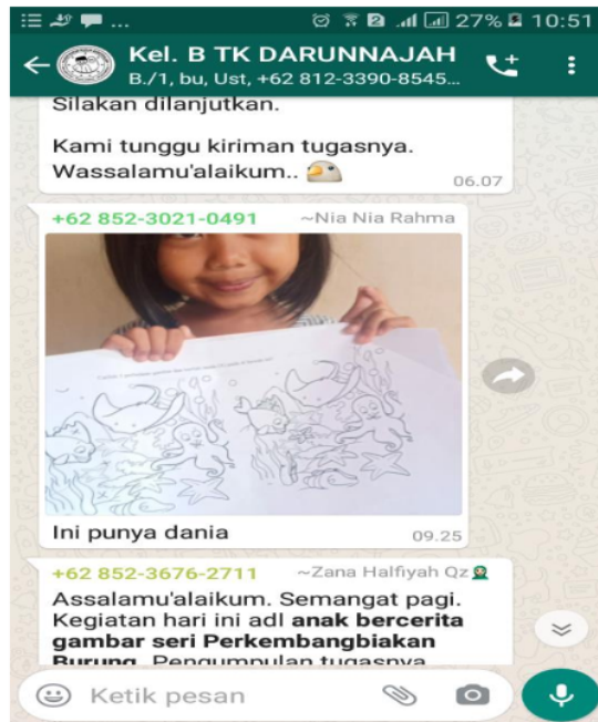
Figure 2. The example screenshot WhatsApp Group of the task : photo