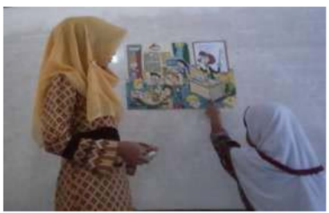
FIGURE 1. Students identify a picture

Marking identified pictures Students label the picture and are asked to label (name) by mentioning the objects that have been identified in the picture.