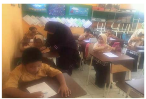
FIGURE 8. Students can classify the types of sentences

Reading and rehearsing to write sentences and paragraphs The teacher, in the next activity, asks students to classify sentences. This section may be slightly difficult, so the teacher can give examples if they are necessary. Afterward, the teacher also models how to place sentences so that they can produce a complete paragraph. Students need to write that paragraph on the board.