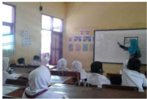
FIGURE 4. The activity of reading and reviewing the words in the picture chart

At this stage, the students are required to read and review the image word chart. Afterward, they are asked to read and repeat the word chart, as in the previous step.