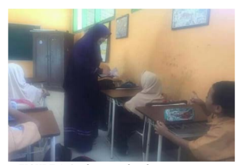
FIGURE 6. Students read and review sentences

• Students are guided by the teacher in making the title of the word chart Students read and review sentences. The next important step is for the teacher to provide guidance to create appropriate titles based on the words. Teachers need to ask the students to think about information of the graph and what they want to say about it.