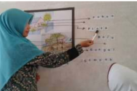
FIGURE 3. Students read the word

Reading and previewing the pictures by reading aloud; Students read the word and spell the word aloud.