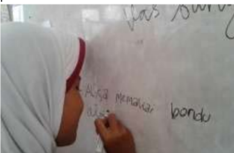
FIGURE 7. Students make sentences or paragraphs

Reading and rehearsing to write sentences and paragraphs The teacher, in the next activity, asks students to classify sentences. This section may be slightly difficult, so the teacher can give examples if they are necessary. Afterward, the teacher also models how to place sentences so that they can produce a complete paragraph. Students need to write that paragraph on the board.