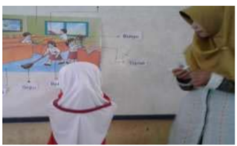
FIGURE 2. Students label the picture chart

Marking identified pictures Students label the picture and are asked to label (name) by mentioning the objects that have been identified in the picture.